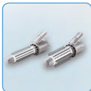
2 styling attachments, ø 22/ 30 mm